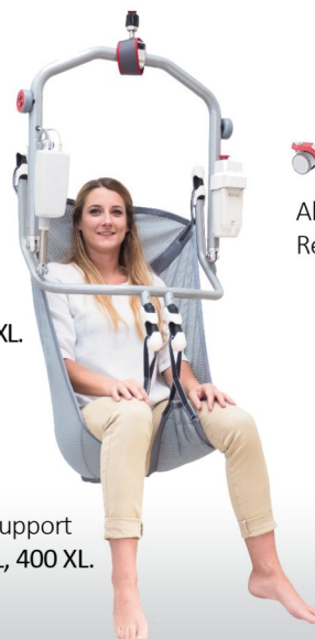
Net bath sling with soft head support Ref. S8554 100 S, 200 M, 300 L, 400 XL.