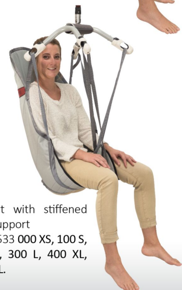
Comfort with stiffened head support Ref. S8533 000 XS, 100 S, 200 M, 300 L, 400 XL, 500 XXL.

The vinyl toilet sling with head support is waterproof and can be cleaned quickly. It is easy to install and to remove thanks to its high position that adapts to all kinds of patients.