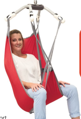
Soft head support Ref. S8612 000 XS, 100 S, 200 M, 300 L, 400 XL, 500 XXL.

Breathable fabric for extended use in contact with the patient.