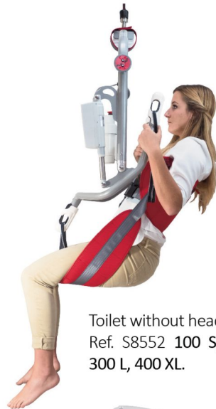
Toilet without head support Ref. S8552 100 S, 200 M, 300 L, 400 XL.