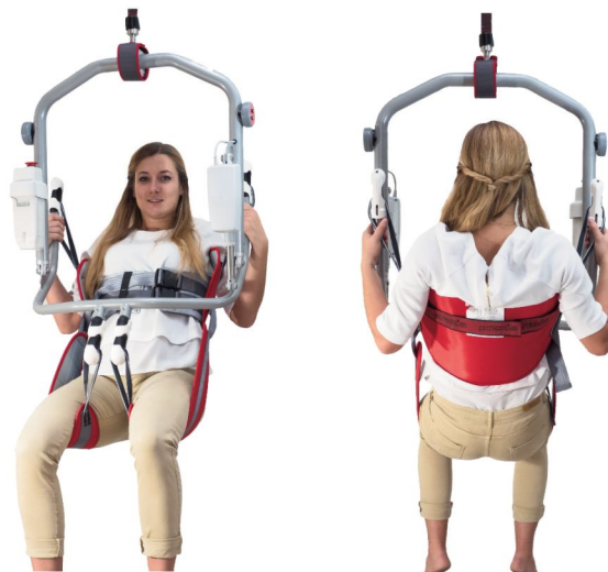
Toilet sling without head support for electrical suspension Ref. S8552 100 S, 200 M, 300 L, 400 XL.