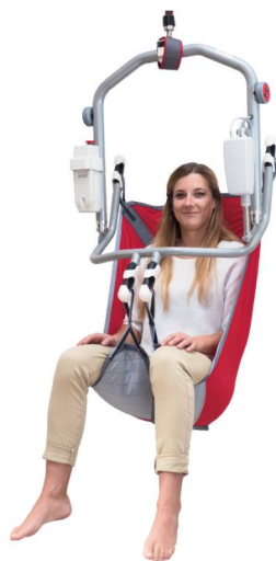
Comfort with head support for ceiling rail suspension Ref. S8553 100 S, 200 M, 300 L, 400 XL.