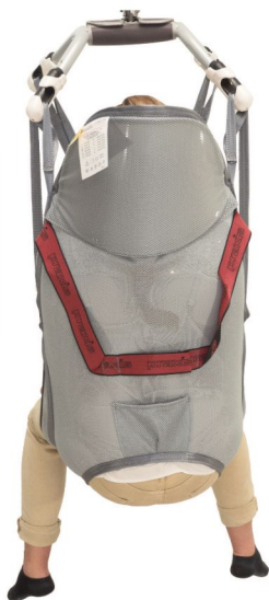
Half-moon head support Ref. S8528 000 XS, 100 S, 200 M, 300 L, 400 XL, 500 XXL.