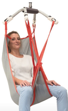
Soft head support Ref. S8623 000 XS, 100 S, 200 M, 300 L, 400 XL, 500 XXL.