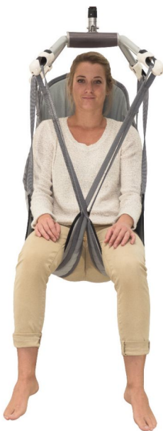
Comfort pad with stiffened head support Ref. S8535 000 XS, 100 S, 200 M, 300 L, 400 XL, 500 XXL.

The vinyl slings help to prevent nosocomial infections. The cleaning and disinfecting must be done by spraying, wiping or damping an approved disinfectant bactericide, fungicide and virucide. The hydrophobic foam filling ensures comfort and avoids shearing. Both models adapt to all types of pathologies and levels of sensitivity of the patient.