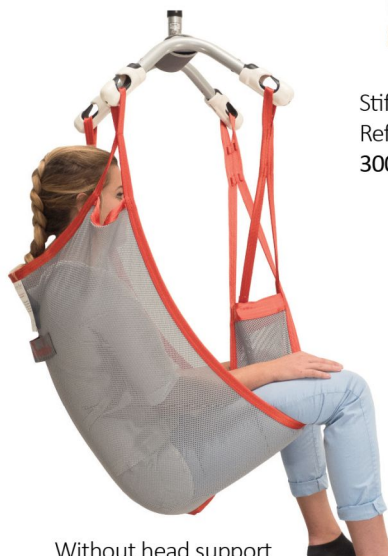
Without head support Ref. S8620 000 XS, 100 S, 200 M, 300 L, 400 XL, 500 XXL.

The improved stiffness of the soft headrests provides a perfect head support. They also prevent the thigh supports from moving under the thighs, assuring a complete painless support.