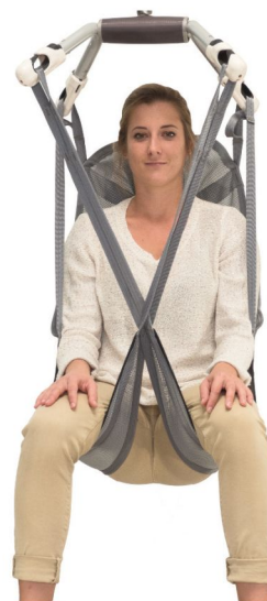
Stiffened head support Ref. S8525 000 XS, 100 S, 200 M, 300 L, 400 XL, 500 XXL.