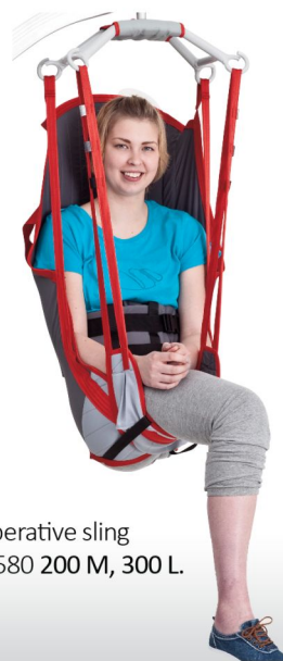
Post-operative sling Ref. S8580 200 M, 300 L.

The post-operative sling for amputated patient is designed for patients with a long or short amputation of one of the lower limbs.