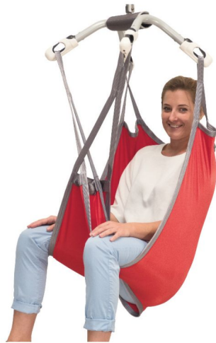
Without head support Ref. S8610 000 XS, 100 S, 200 M, 300 L, 400 XL, 500 XXL.

They are designed for multi-functional transfers which allow an easy positioning and better comfort. The adjustment of the loops in the sitting position, the semi recumbent position or the lying down position allows the transfer on all supports.