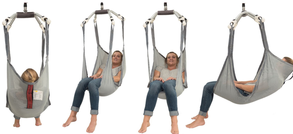
Hammock sling in polyester. Ref. S8521 200 M, 300 L.