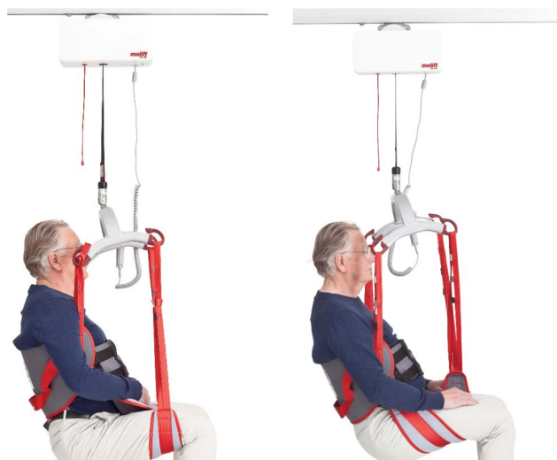
Easy Rgo polyester without head support Ref. A1720 510 XS, 520 S, 530 M, 540 L, 550 XL, 560 XXL.