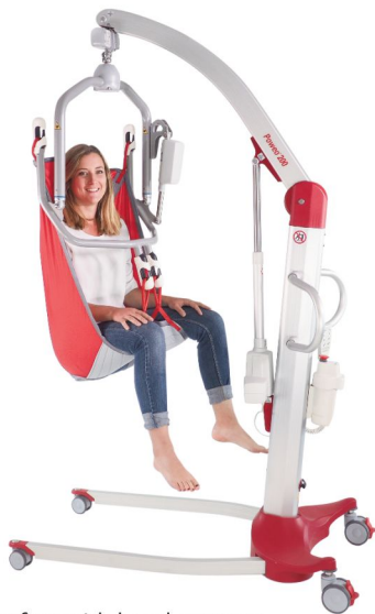
Comfort with head support Ref. S8553 100 S, 200 M, 300 L, 400 XL.