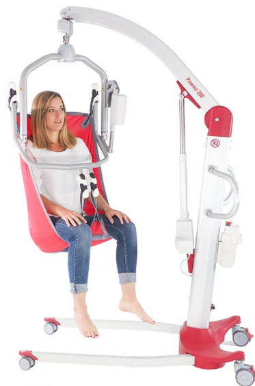
All day Ref. S8555 100 S, 200 M, 300 L, 400 XL.