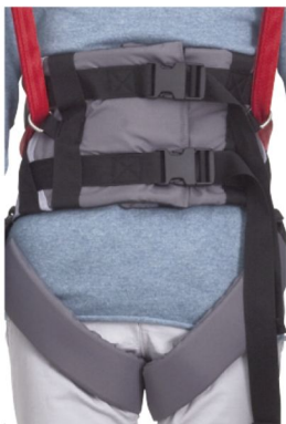
Walking sling with security belt Ref. A1721 320 S, 330 M, 340 L, 350 XL.

They are perfect for reeducation as they enable a vertical position. The patient is perfectly supported and can move safely.